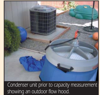
Condenser unit prior to capacity measurement showing an outdoor flow hood.

Per site costs represented the major cost difference for participating HVAC contractors between VSP and non-VSP service calls. Per site costs were dependent on various factors including data upload costs, inspection costs and actual bid costs per job. These costs ranged from $37.60 to $250 flat fee per site.