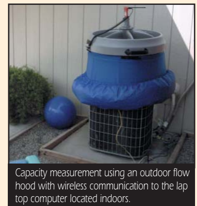
Capacity measurement using an outdoor flow hood with wireless communication to the lap top computer located indoors.