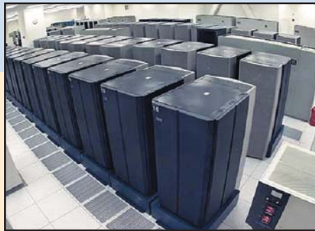
Typical Data Center Layout

RESULTS: The top two emerging technologies were found to be (1) Air management system design, and (2) Air-side HVAC economization. Based on various market studies, it is estimated that the potential energy savings in California could reach 14 MW for air management improvement and 3 MW for utilizing air-side HVAC economization.