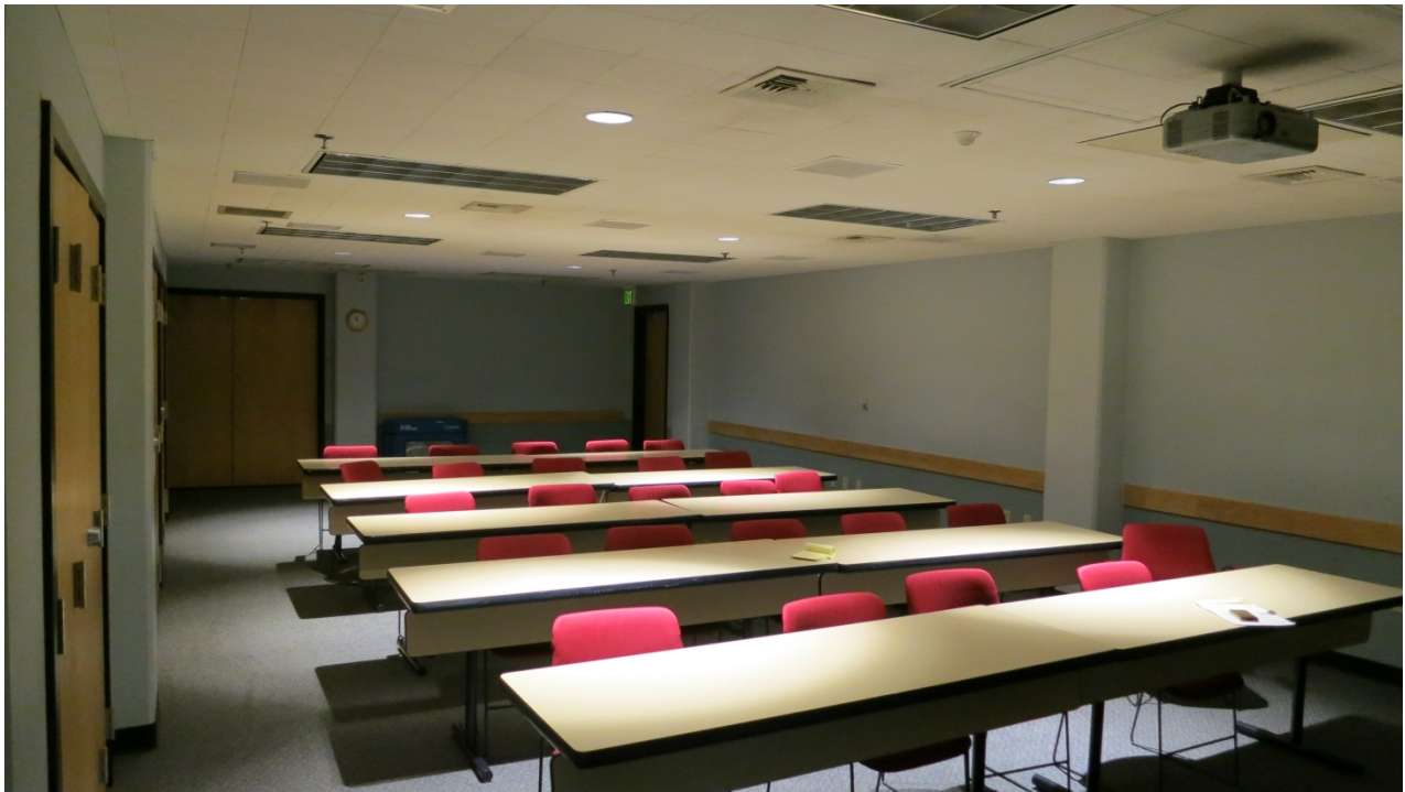
FIGURE 5. CITY HALL TRAINING ROOM

The City Hall project was completed by the City's building maintenance supervisor, in a meeting/training room located in the City Hall. The application received was for 12 PAR38 20 watt LED lamps. The room is usually used for training sessions for City employees. Training sessions regularly incorporate an overhead projector or video. See Figure 6 below for a view of the room layout and lighting: