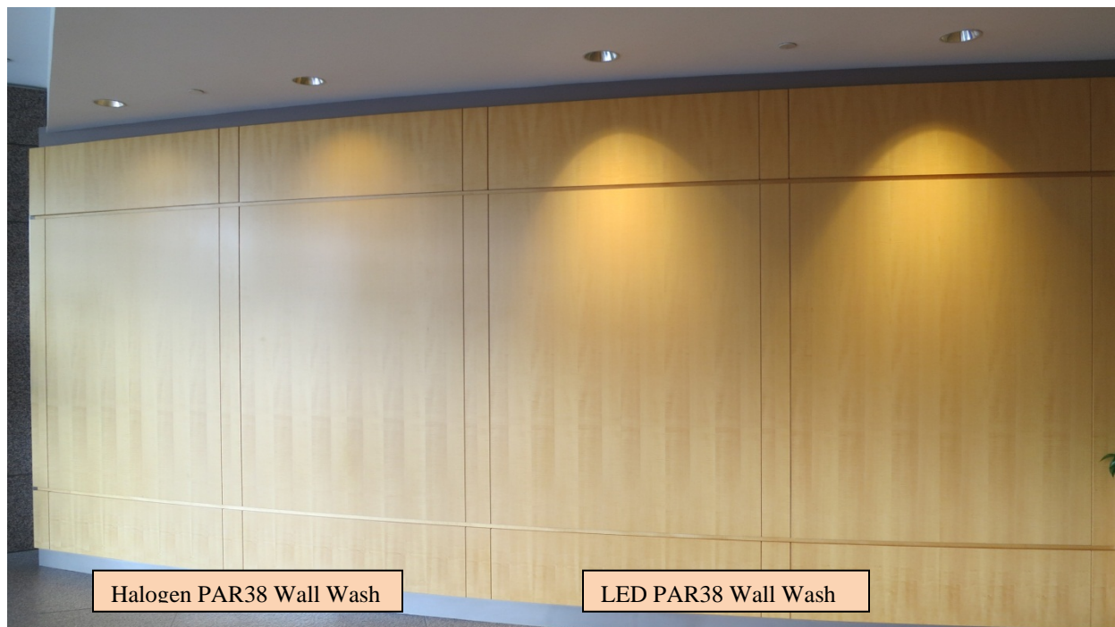
FIGURE 4. HALOGEN PAR38 AND LED PAR38 SIDE-BY-SIDE COMPARISON

The chief engineer had mixed reviews of the new LED PAR38s. While pleased with the wattage reduction from the base case 75 watt lamp, he found the replacement LEDs to be too bright, resulting in sharp contrasts on the wall, and too much light would reach beyond the wall and onto the floor. He was also concerned with the light discoloring the wood, though it seems more likely that discoloration would occur due to the higher operating temperatures of halogen lamps. The facility engineer had a differing opinion and preferred the LED PAR38s, citing beam definition and the overall increase in light levels as being significant improvements. It is true that light levels were quite high on the floor during the day (up to 160 FC), but the lobby area was exposed to daylight and the facility engineer noted that light levels were much lower at night.