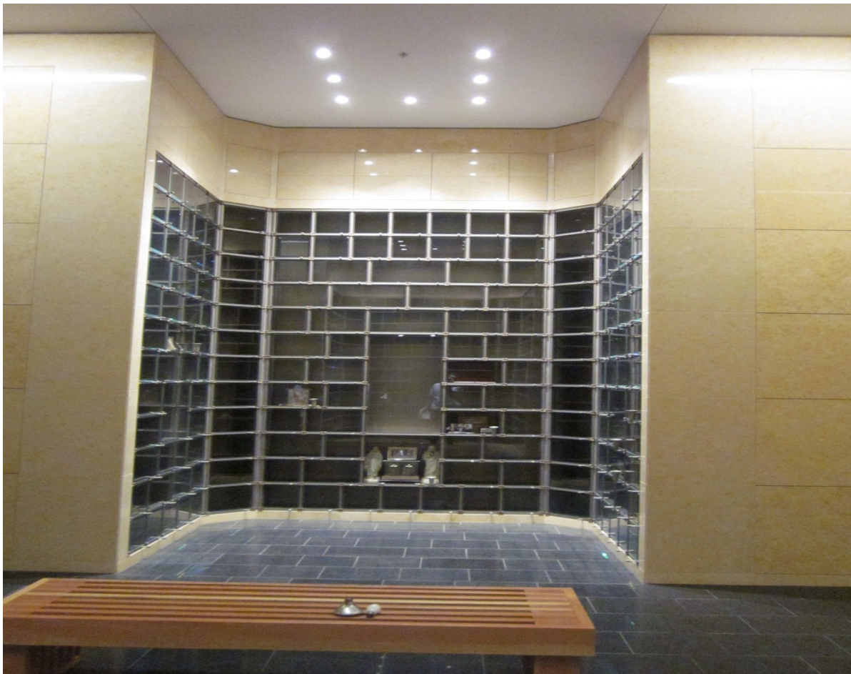
FIGURE 2. LED MR16 LAMPS INSTALLED IN MAUSOLEUM AREA

The MR16s were installed in the church's mausoleum, found in the lower level of the building. There is no daylighting, but a daylighting-like effect is produced by backlighting behind some of the walls. There was limited reflectivity in the space, due to the prevalence of dark stone floors and glass. Operating hours of the lamps in this area were nearly 24 hours a day. See Figure 2 to view the application of the MR16 LEDs.